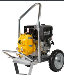
VAR 3-100 B TROLLEY - R