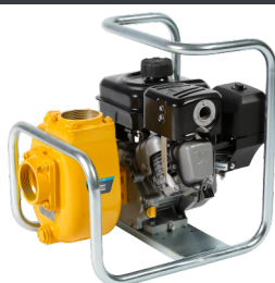
VAR 3-100 B LIFT - R